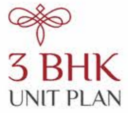
TYPE - 2