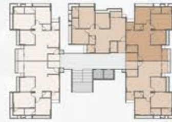
TYPE - 1